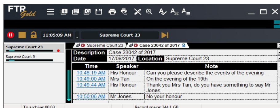
FTR Gold Monitoring Suite™